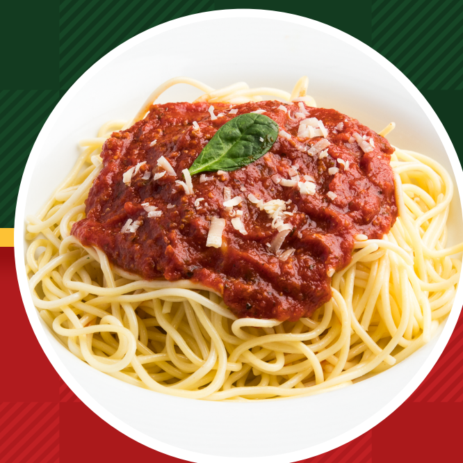
FAMILY SIZE SPAGHETTI ADD MEATBALLS $4