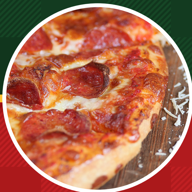
LARGE 2-TOPPING PIZZA