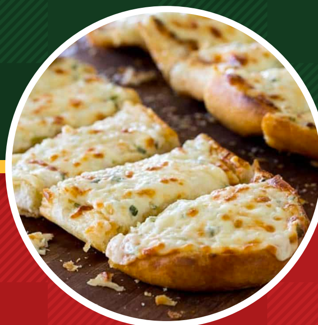
GARLIC BREAD WITH CHEESE